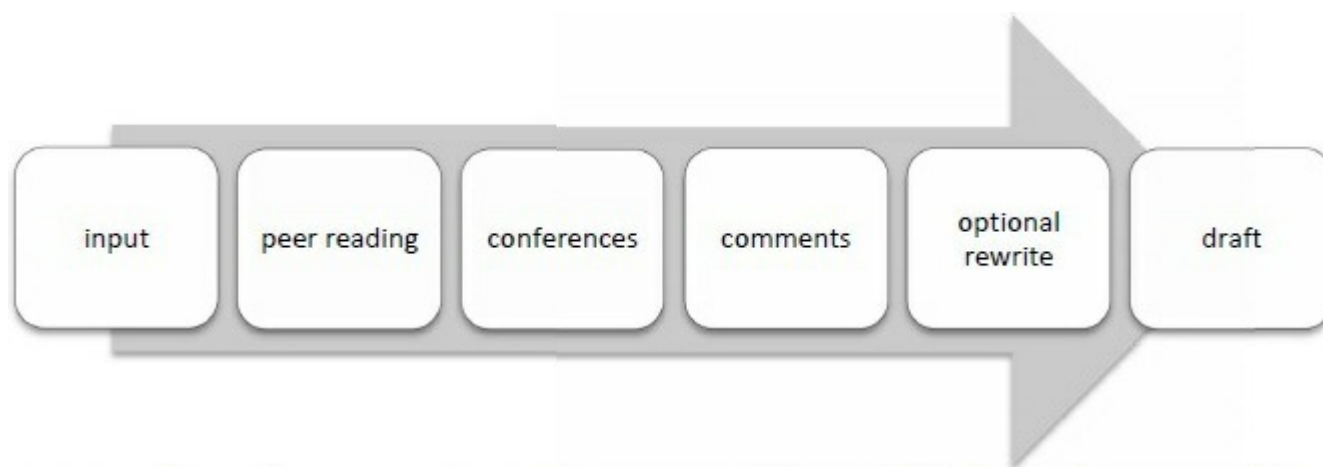
Figure 2.3. Implementation of Feedback

'Input' on the continuum on Figure 2.3 means anything which helps students to get ideas for writing. This includes invention strategies such as brainstorming, fast writing, clustering and interviewing. This may also include readings for models of good writing (for a particular type of assignment such as compare/contrast) or readings related to a particular topic. Once students have received input for writing, they write their first draft (D1). They are made aware that D1 is only a draft. After D1 is written, students receive their first form of feedback from peers (Keh, 1990:295).